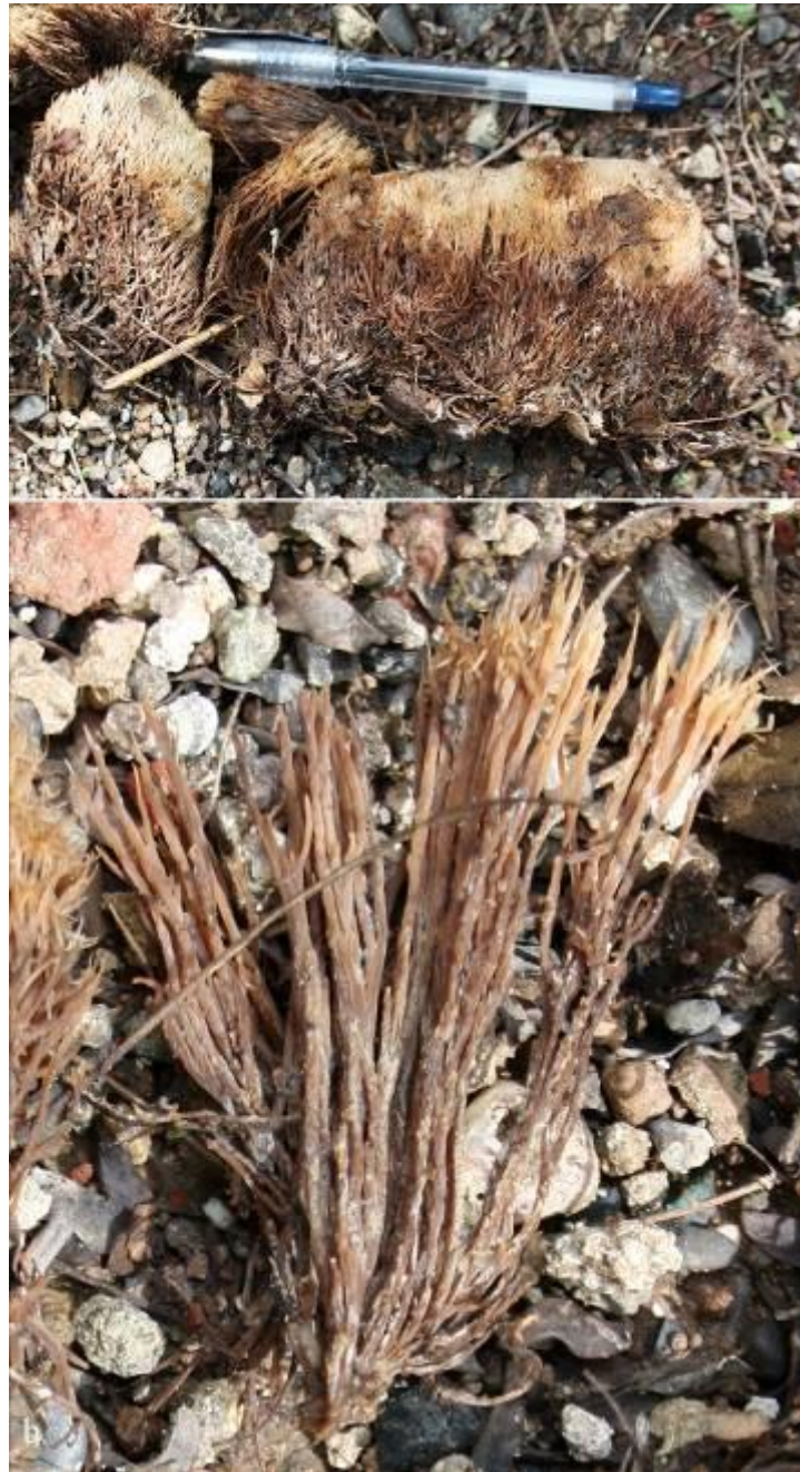
Fig. 1 – Pterula indica . Macroscopic features. a Basidiomes in situ (Holotype AMH 9430). b Individual basidiome.