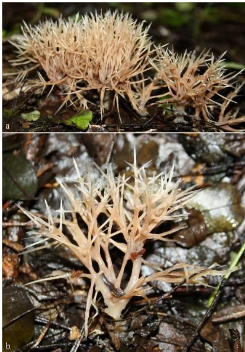
Fig. 2 – Pterula verticillata . Macroscopic features. a. Basidiomes in situ. b. Individual basidiome.

Pterula verticillata is a very distinctive species growing largely on soil, occupies large area of soil and the mycelium also extensively colonize the litter and produce basidiomes every year during monsoon (August–October). Pterula verticillata closely resembles P. decumbens (Corner et al. 1957) described from India. However, P. decumbens clearly differs from P. verticillata by its decumbent, brown basidiomes, and composed of main axis which gives off lateral branches, attached to the substratum by numerous rhizoidal branches. Whereas P. verticillata has erect, pale orange to peach basidiomata and the main axis gives off verticillate to irregular branches.