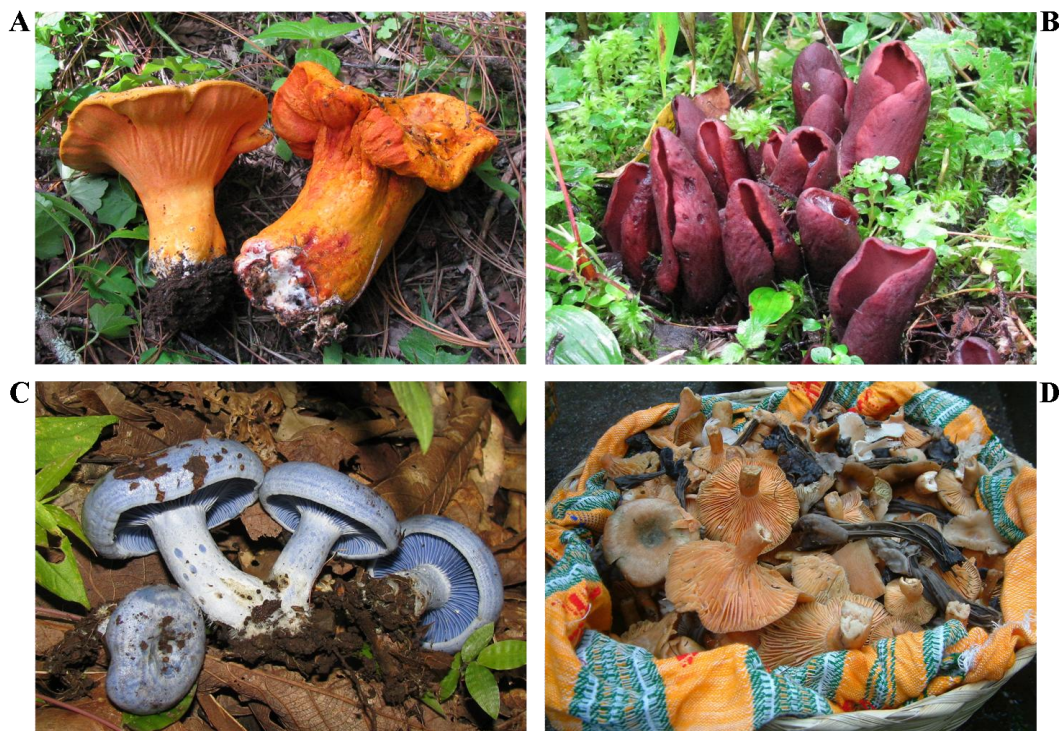
Figs 2 (A–D) – Diversity of Guatemala macromycetes. A Hypomyces lactifluorum . B Wynnea americana . C Lactarius indigo . D ‘medida’ (portion) of mixed edible mushrooms on sale at the municipal market of Tonicapán.

area and, together with adjacent areas of Belize and southern Mexico, comprise the largest unbroken tract of tropical forest north the Brazilian Amazon. In a survey of 0.1 ha in the Cordillera Talamanca, Costa Rica, Gregory Mueller and Roy Halling have reported some 200 species of macrofungi in a parcel of native forests hosting only 20–25 species of vascular plants and just two ectomycorrhizal angiosperms (Halling & Mueller 2002). There is no reason to believe that Guatemala forests would be any less diversified.