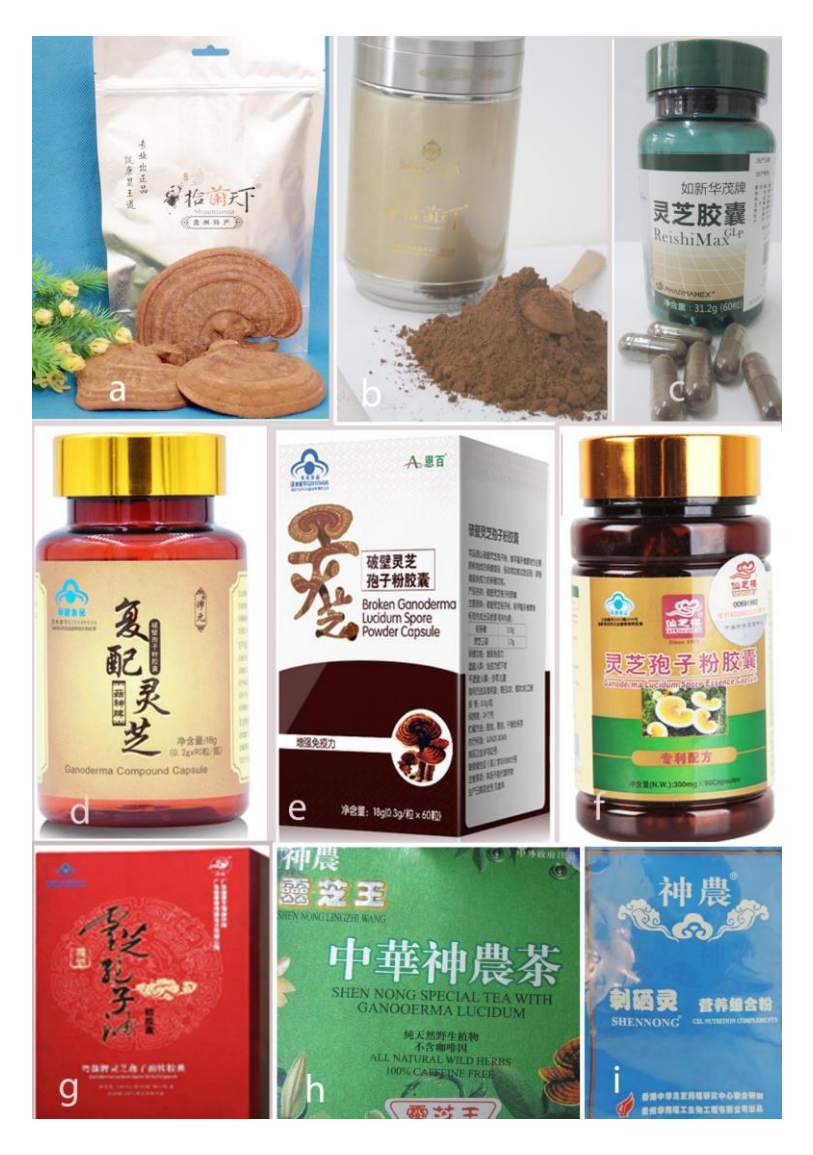
Fig. 1 – Ganoderma products use as drug supplements and food. a. Ganoderma fruit body. b. Ganoderma spore powder. c. Ganoderma spore powder capsules. d. Ganoderma compound capsules. e. Broken Ganoderma lucidum spore powder capsules. f. Ganoderma spore essence capsules. g. Ganoderma spore oil. h. Ganoderma lucidum tea, i. Se enriched Ganoderma nutrition complements.

In the mid-nineties of the 20<sup>th</sup> century, molecular phylogenetic analyses indicated that collections named as G. lucidum in East Asia were in most cases not conspecific with G. lucidum from Europe (Yang & Feng 2013). The taxonomy of the G. lucidum complex has long been subject to debate and even after many years of discussions, the taxonomy of the G. lucidum complex remains still problematic. The main purpose of this paper is to identify the taxonomic problems in the G. lucidum species complex. In this study, the phylogeny of the G. lucidum complex was examined by analysis of 5.8S–ITS rDNA, RPB1, and EF–1 \alpha sequence data representing species from Asia, Europe and North America to clarify the phylogenetic relationships within this complex.