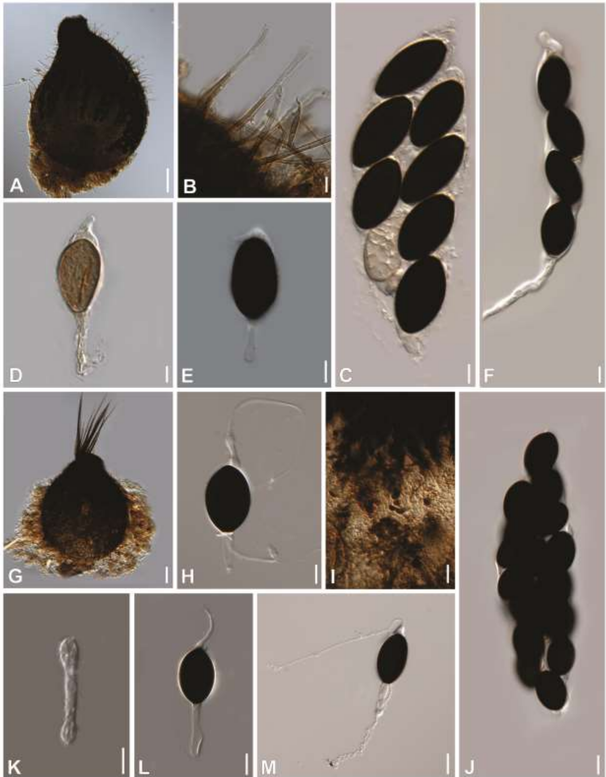
Fig. 2 – Podospora inflatula . (A) Perithecium (bar = 100 \mu m), (B) rigid hairs with inflated tips (bar = 10 \mu m). Podospora longicaudata . (C) Mature ascus (bar = 10 \mu m), D. ascospore (bar = 10 \mu m). Podospora ostlingospora . (E) Ascospore (bar = 15 \mu m). Podospora pauciseta . (F) Mature ascus (bar = 10 \mu m). (G) perithecium (bar = 100 \mu m), (H) ascospore (bar = 10 \mu m). Podospora pleiospora . (I) Tubercles on the perithecial neck (bar = 7.5 \mu m), (J) Mature ascus (bar = 12.5 \mu m), (K) immature ascospore (bar = 5 \mu m), (L) Mature ascospore (bar = 12.5 \mu m). Podospora prethopodalis . (M) Mature ascospore (bar = 15 \mu m).