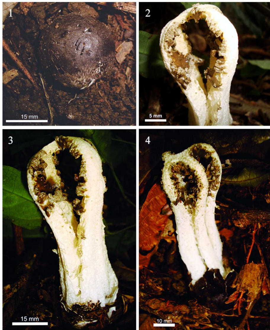
Figs 1–4 – Blumenavia angolensis . 1 Unexpanded basidioma. 2 View of glebifer; 3, 4. Mature basidioma.

and photographed in the field. Color determination was referenced according to Kornerup & Wanscher (1978). Macroscopic and microscopic studies were based on Dring (1980) and Lopez et al. (1981). Collections were deposited in the UFRN herbarium.